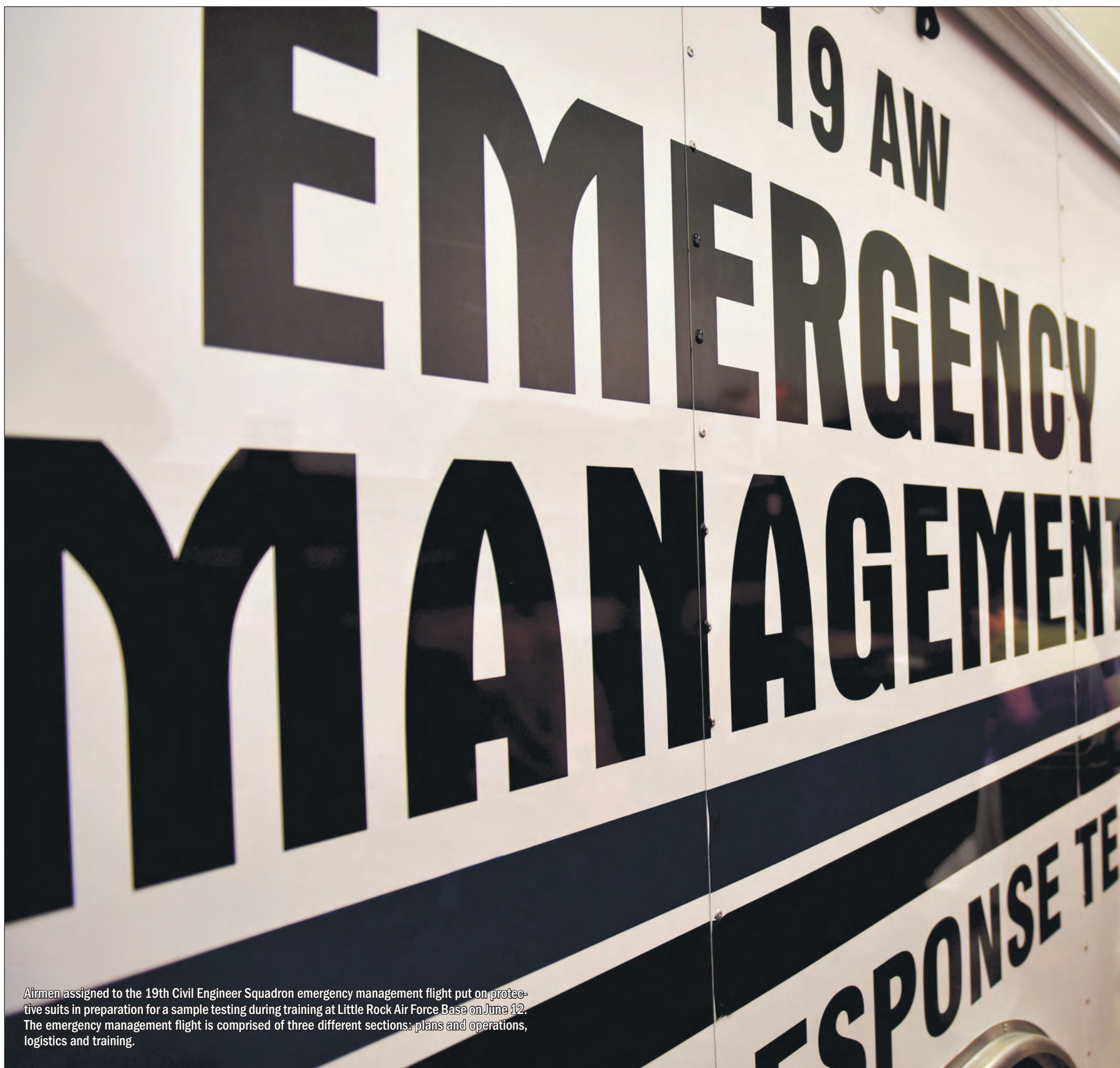
Airmen assigned to the 19th Civil Engineer Squadron emergency management flight put on protective suits in preparation for a sample testing during training at Little Rock Air Force Base on June 12. The emergency management flight is comprised of three different sections: plans and operations, logistics and training.